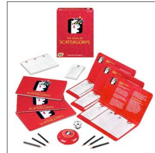
Scattergories by Hasbro