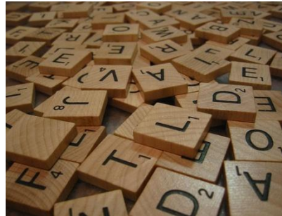
Scrabble by Hasbro